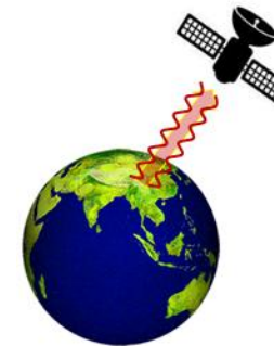
BLUETONGUE OUTBREAKS IN ANDHRA PRADESH 2000-2013