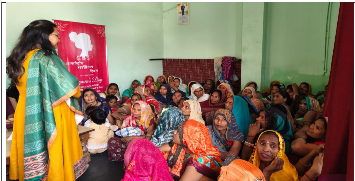
Glimpses of Farm Women Sensitisation Programme @ Mawai village, Bhojipura, Bareilly

An Awareness Programme on Work–Life Balance was organized on 2 nd March 2026 for female students of the ICAR-Indian Veterinary Research Institute, Izatnagar. The programme aimed to sensitize young women scholars about the importance of maintaining a healthy balance between professional commitments and personal well-being, particularly in demanding academic and research careers.