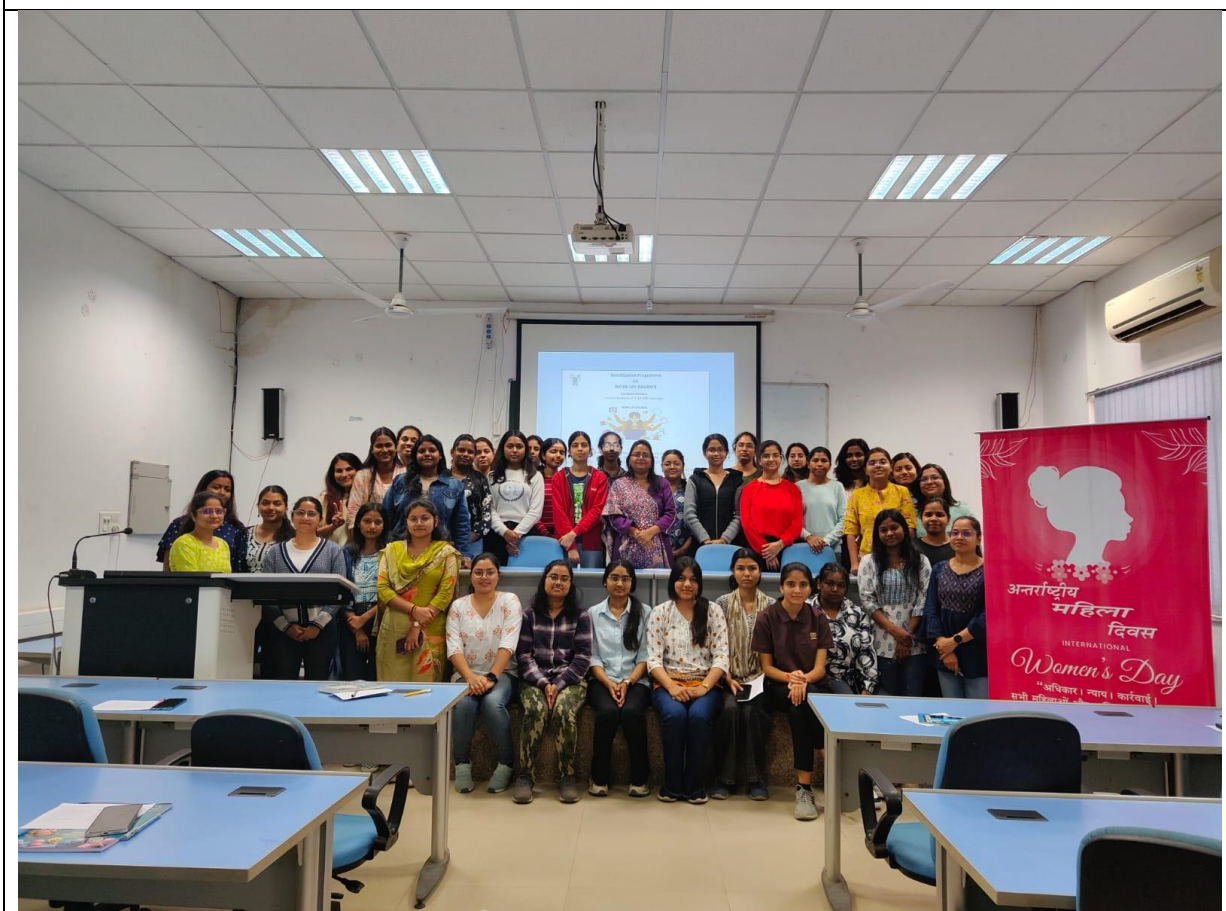
Glimpses of Awareness programmes on Work Life Balance