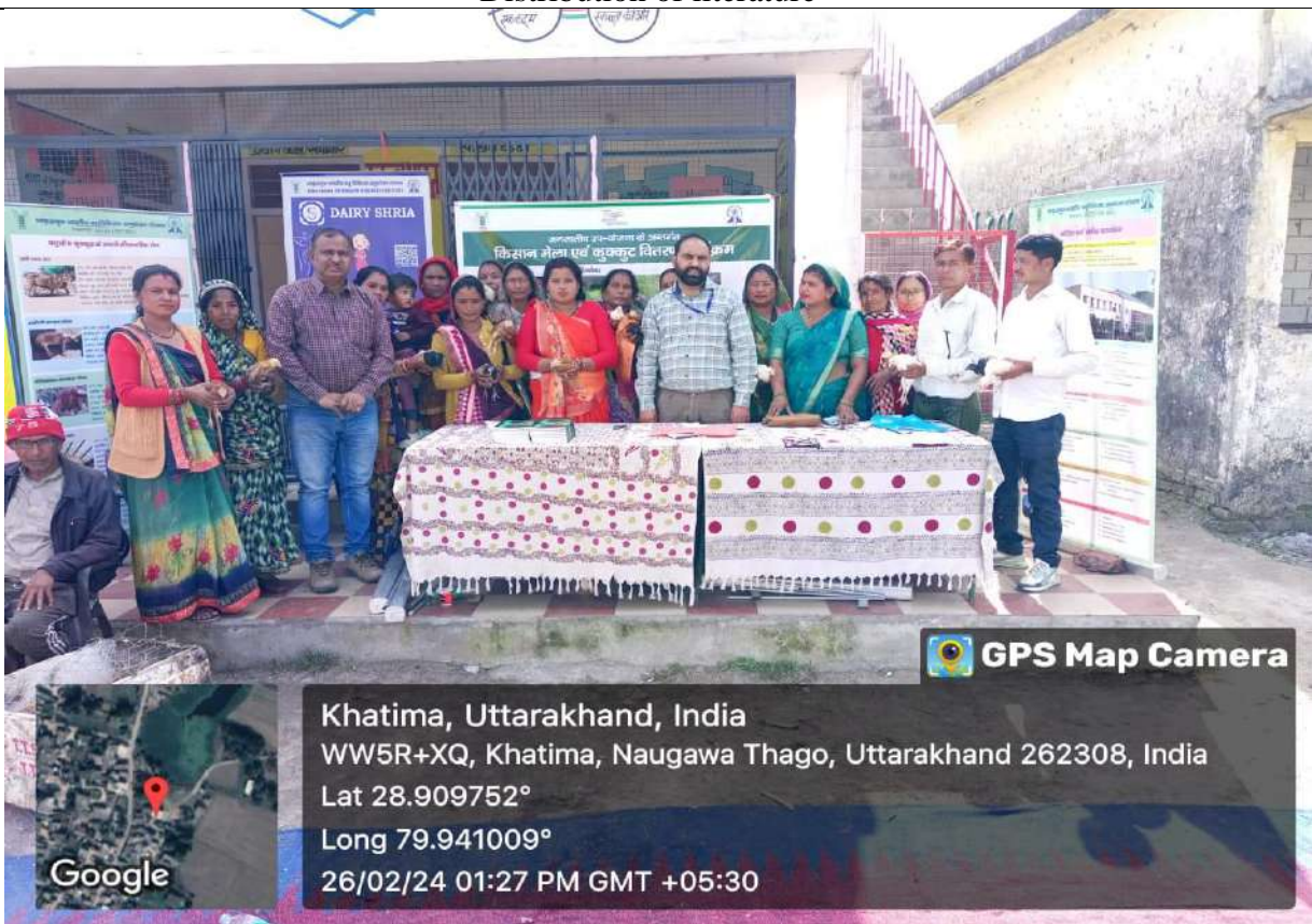
Distribution of literature

Khatima, Uttarakhand, India WW5R+XQ, Khatima, Naugawa Thago, Uttarakhand 262308, India Lat 28.909752° Long 79.941009° 26/02/24 01:27 PM GMT +05:30