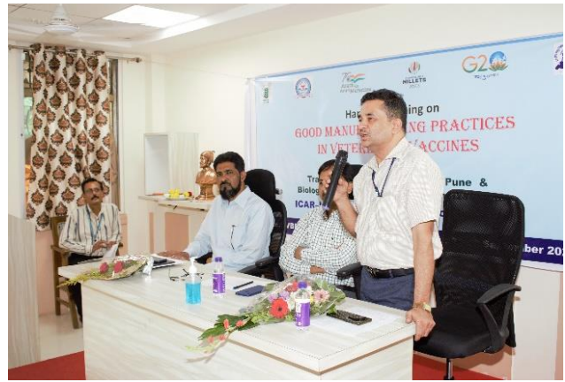
Address by SIC, TEC, Pune