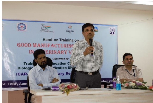
Address by the Chief Guest during the inaugural function