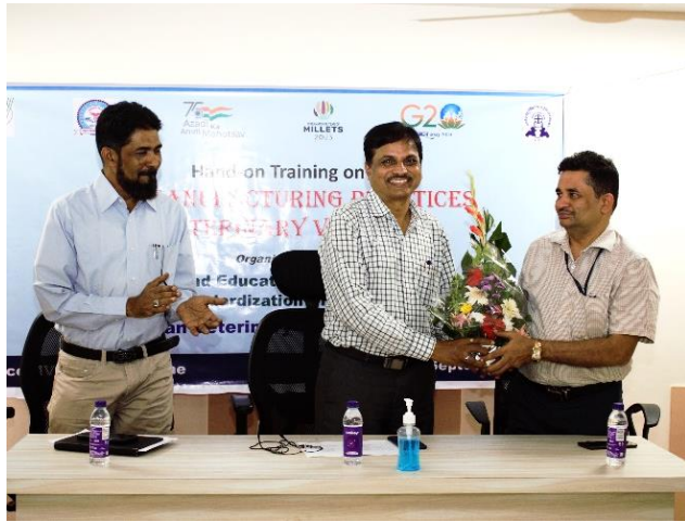
Welcome of Chief Guest and Guest of Honour by SIC, TEC, Pune