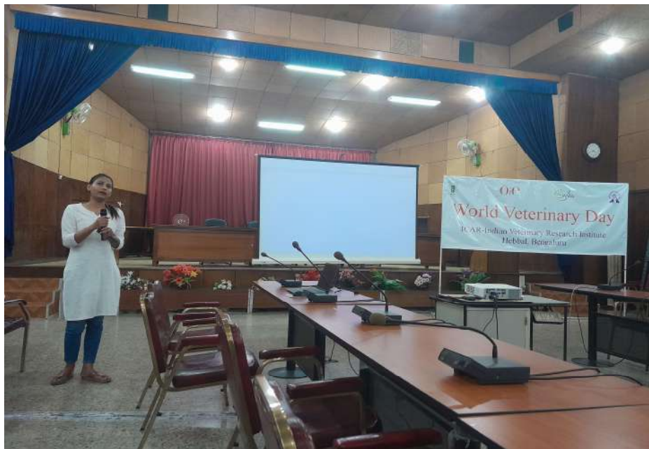
Participation of student in Debate competition