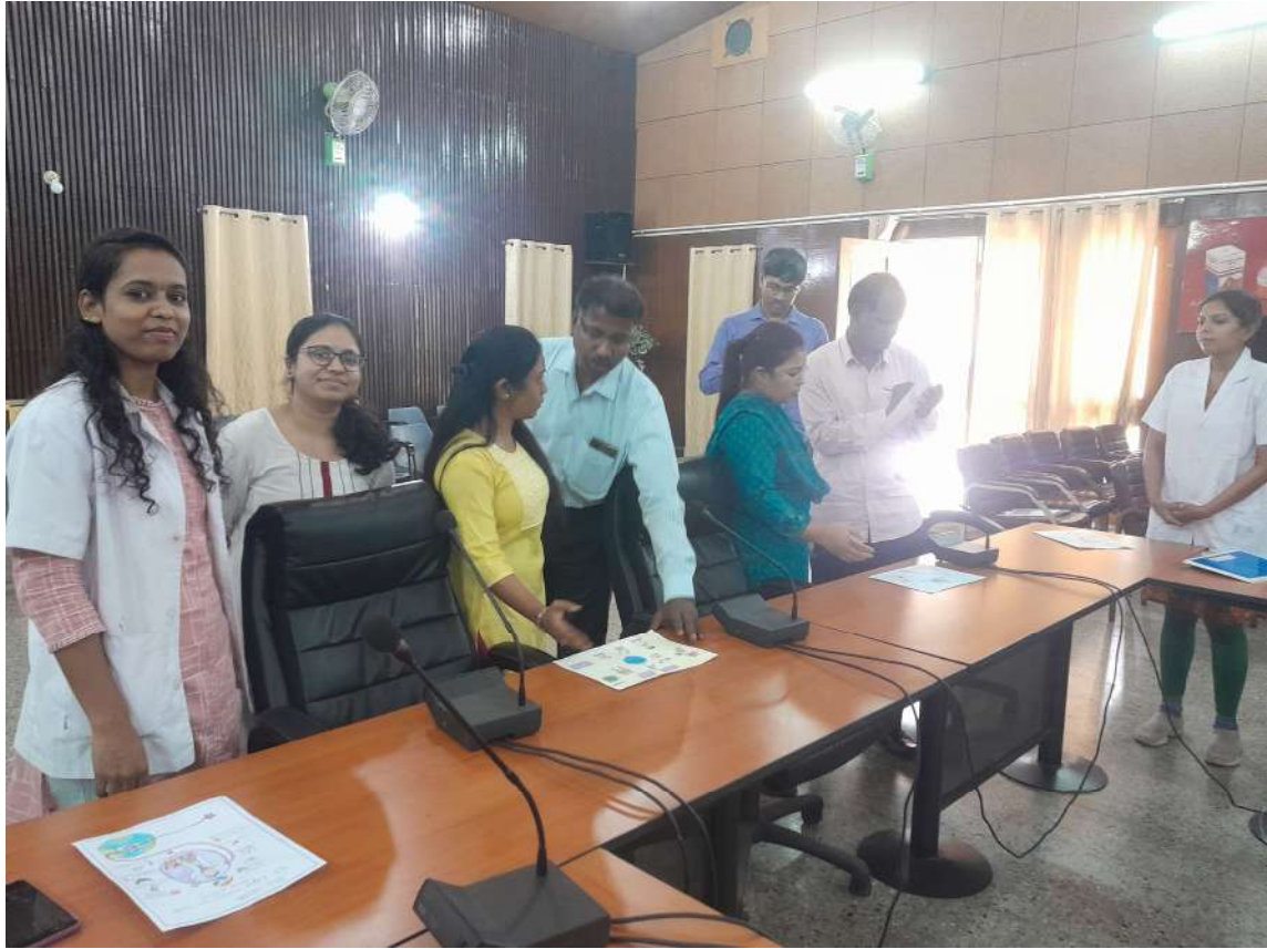
Judging of the drawing competition by Scientists