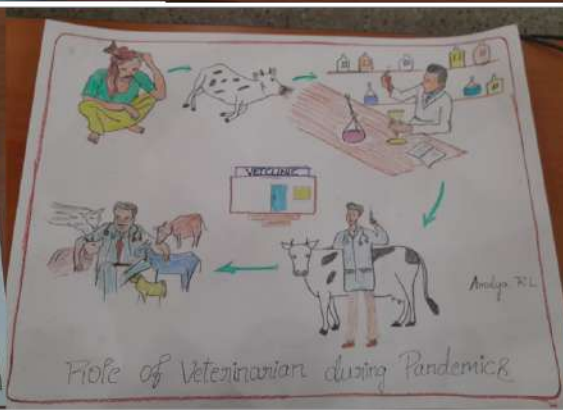
Representative drawings made by students