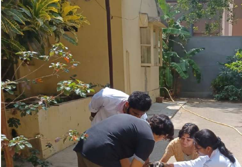
Vaccination of campus dogs by students