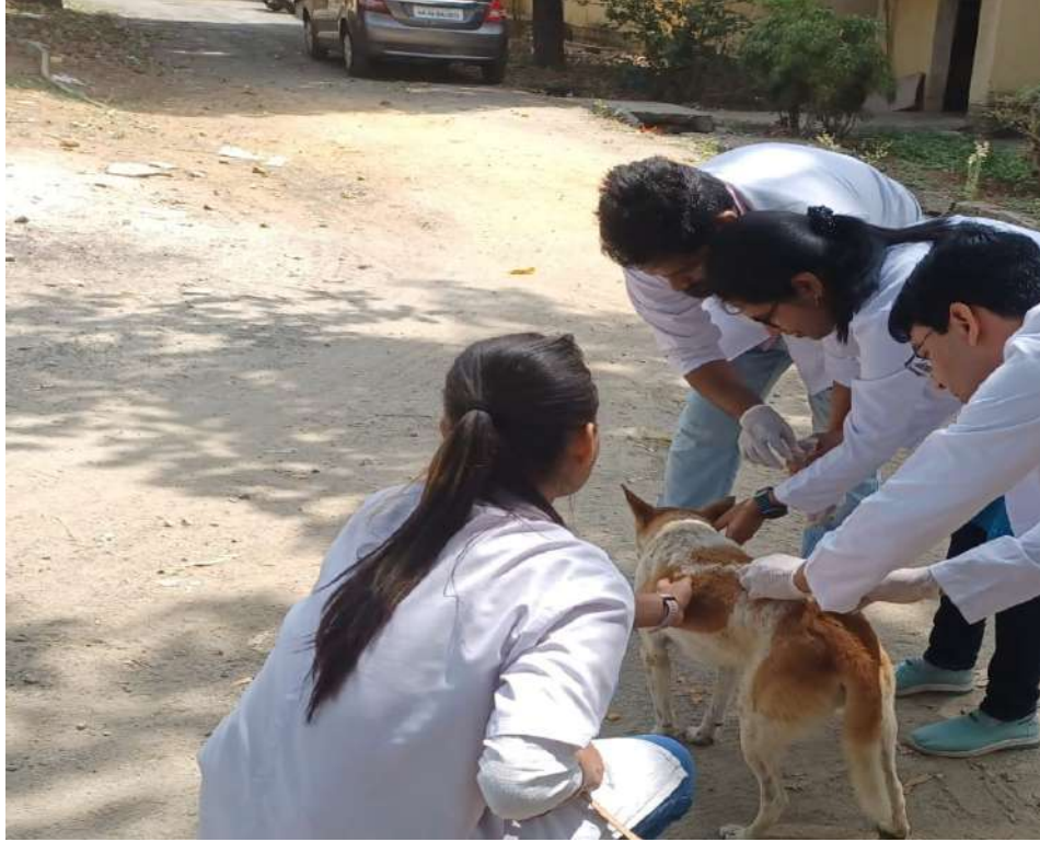
Vaccination of campus dogs by students