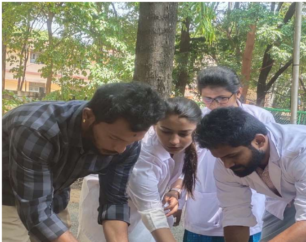
Vaccination of campus dogs by students