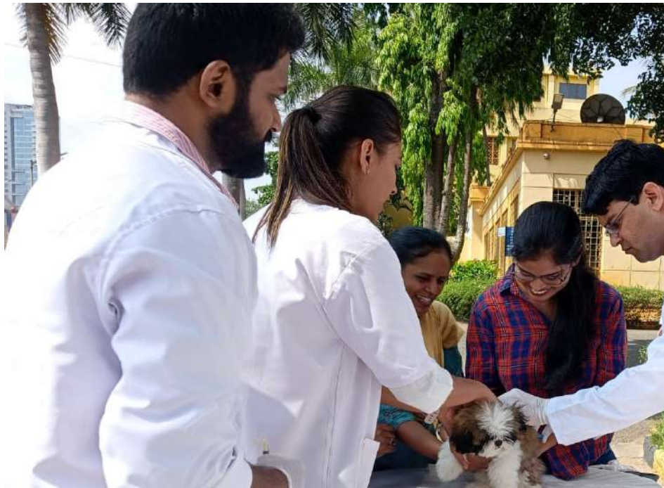
Vaccination of campus dogs by students