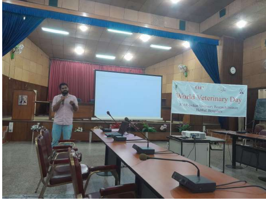
Participation of student in Debate competition