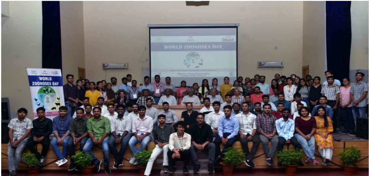
Celebration of World Zoonoses Day at IVRI