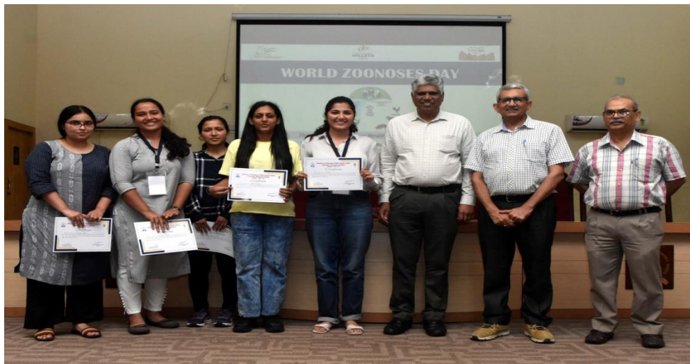
Participants of winning team with faculty of VPE