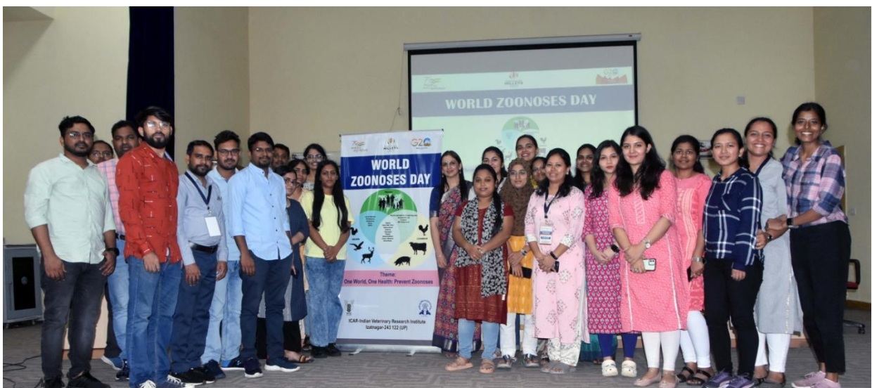
Active participation of trainees of DST sponsored workshop in WZD celebration