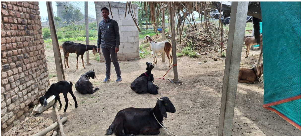
Goats are kept in semi-open low-cost shed made of brick and shed net