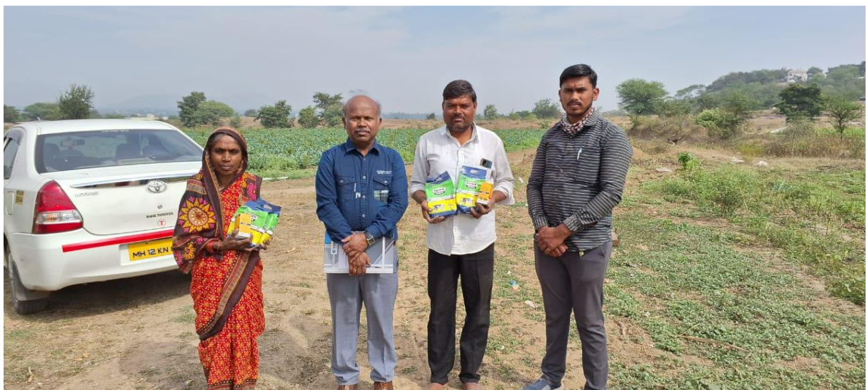
Distribution of mineral-vitamin mixture to farmers