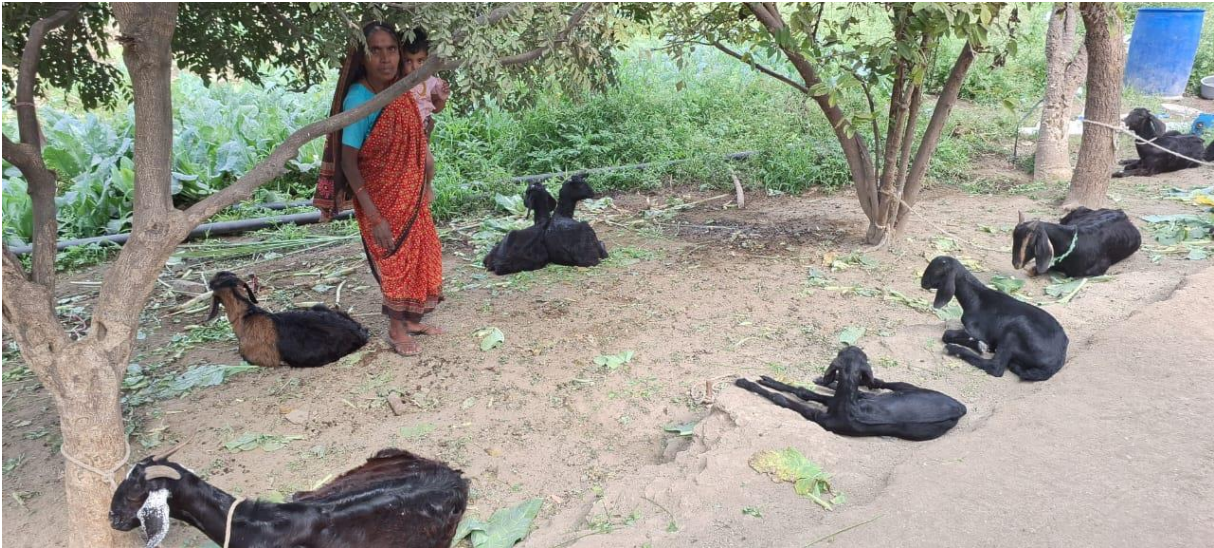
Goats of a lady farmer are taking fodder under tree shed